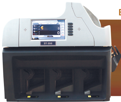
Banknote Processing Machine